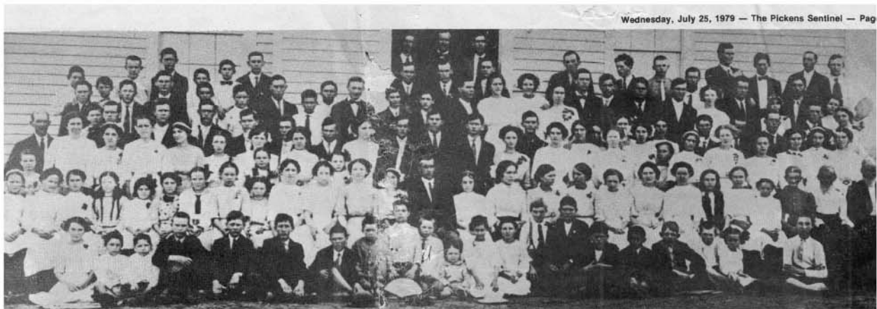
1912 Singing School

In the early years of the church, most members knew how to read music, largely due to the influence of the singing schools. Music was an important thread in the fabric of the church. It is safe to say that the fellowship associated with singing and musical gatherings played integral parts in the founding and growth of our church. This is not to diminish the core purpose of the church, to reach souls for Christ and teach the word of God. In those days music was an important social and community event before the days and availability of radio, television, and other forms of entertainment.